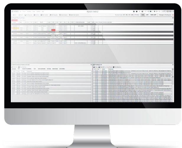
Real-time, unified flight plan and meteorological data

The flight plans from Insero AIMS are also available in the Insero E-STRIP electronic flight strip application.