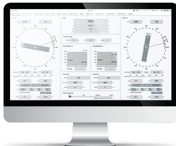
Real-time, unified weather information

Insero AWOS is developed in accordance with EURO-CONTROL, EASA, ICAO, and WMO regulations and standards.