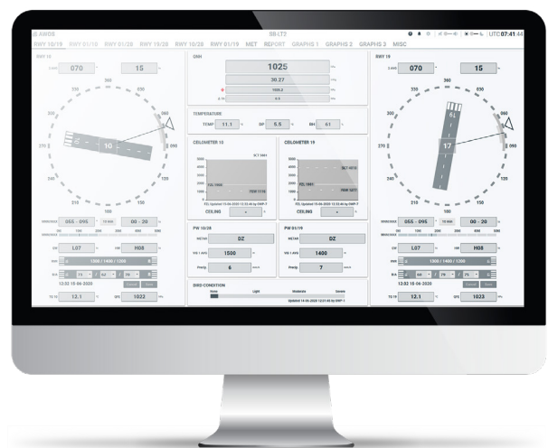
Real-time, unified weather information

Insero AWOS is developed in accordance with EUROCONTROL, EASA, ICAO, and WMO regulations and standards.