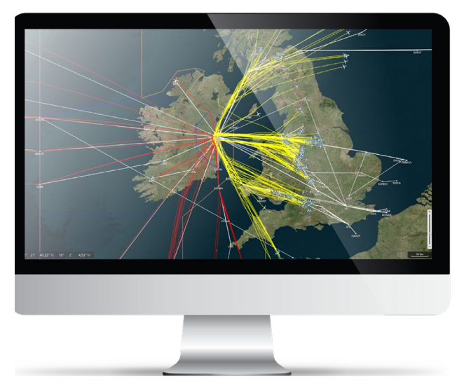
Collect, process and analyse flight data with Insero SERIS

Included in the analyser tool are three advanced analysis features: The Vertical Flight Efficiency Analyser, Airspace Analyser and Terminal Route Analyser enabling you to effectively evaluate causes for inefficiencies, identify best practices, map emission cycles and much more.