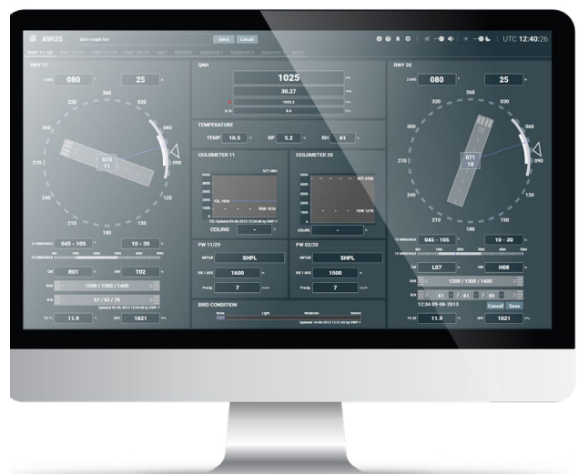
Real-time, unified weather information

Insero AWOS is developed in accordance with EUROCONTROL, EASA, ICAO, and WMO regulations and standards.