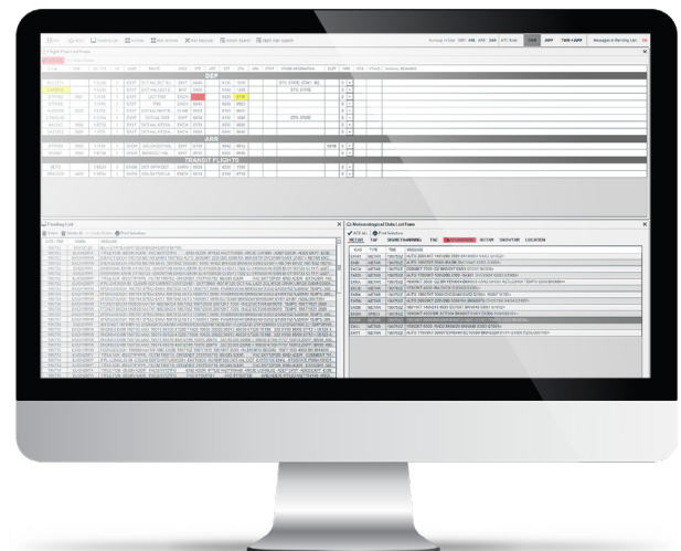
Real-time, unified flight plan and meteorological data

The flight plans from Insero AIMS are also available in the Insero E-STRIP electronic flight strip application.