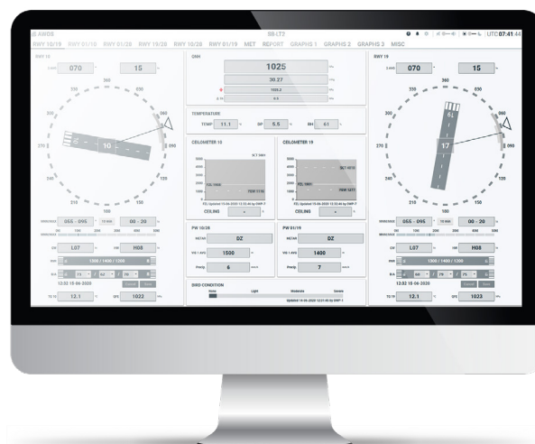
Real-time, unified weather information

Insero AWOS is developed in accordance with EUROCONTROL, EASA, ICAO, and WMO regulations and standards.