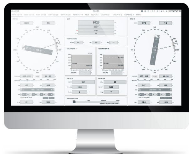
Real-time, unified weather information

Insero AWOS is developed in accordance with EUROCONTROL, EASA, ICAO, and WMO regulations and standards.